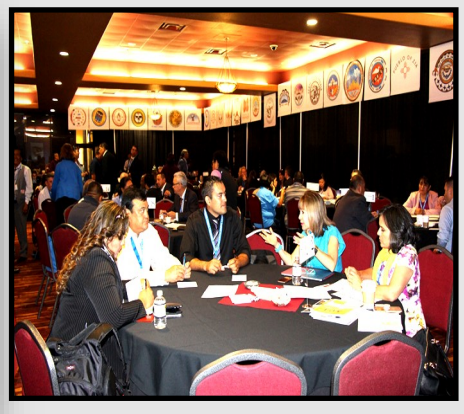
HED staff and the Pueblo of Santa Clara

The 2018 State-Tribal Leaders Summit was held on June 6-7. 2018 at the Pueblo of Acoma, Sky City Casino Hotel and Conference Center. This annual Summit is held in accordance with the State-Tribal Collaboration Act (STCA) between the State of New Mexico and New Mexico Tribes, Nations and Pueblos to address issues of mutual concern. During the two-day Summit, topics of discussion were on the following: Substance Abuse and Intervention; Capital Outlay Processes; Targeted Response to the Opioid Crisis; Infrastructure Development and Collaboration (Opportunity Zones); Deployment of the NM Nationwide Public Safety Broadband Network; and Drought and its Effects on NM. Tribal leaders, their program directors and staff exchanged information, addressed issues, and collaborated with State Cabinet Secretaries and staff representing the respective agencies. In preparation for the Summit, the presenters met several times to prepare and coordinate their presentations. The time spent on the topic of discussion was acknowledged by attendees and was of value and appreciated. Pueblo of Acoma Governor, Kurt Riley delivered the invocation and welcome address and stated, "almost all of us would agree that the first step to building good relationships is communication, is collaboration, and most importantly, is consultation". (continued on next page)