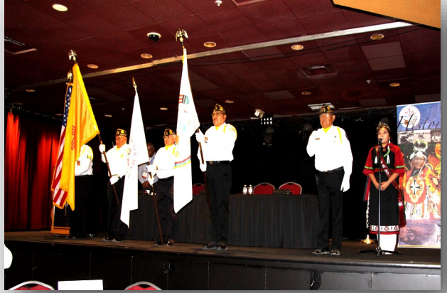
American Legion Post 116 and Miss Teen Acoma