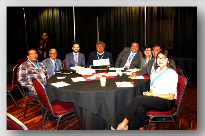
IAD staff and Pueblo of Acoma leadership