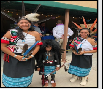
Acoma Pueblo Youth Dance Group